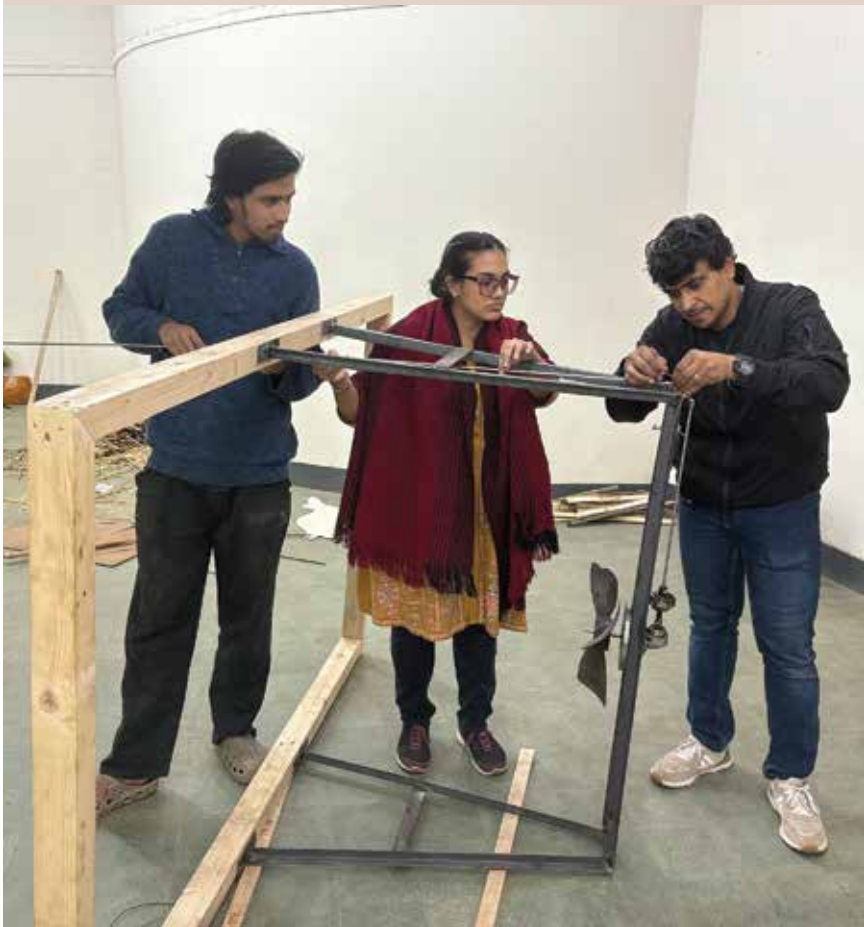
Media : Wood, Steel and mirror paper

Renewable energy sources like wind and solar power are reshaping energy production, offering sustainable alternatives to fossil fuels. These eco-friendly solutions play a vital role in combating climate change, reducing carbon emissions, and securing a cleaner future. By harnessing wind and sunlight, society can minimize reliance on finite resources, enhance energy security, and stimulate economic growth through green job creation. Investing in renewables protects the planet for future generations.