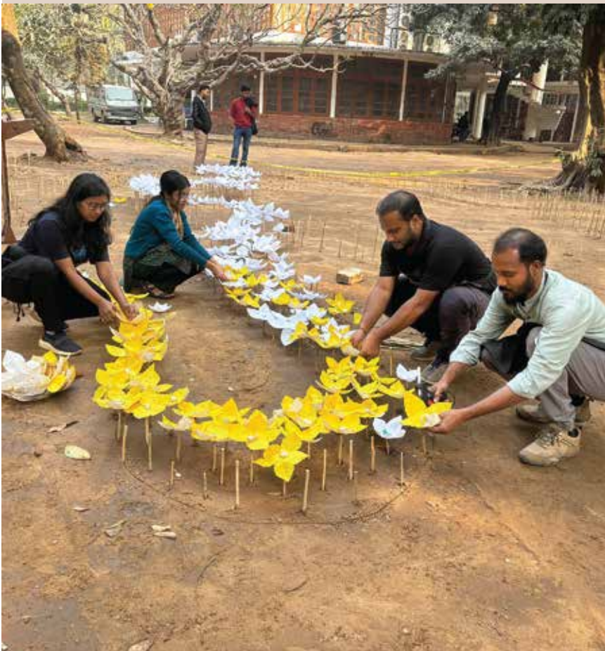
Media : Paper and bamboo sticks

Bangladesh, a land shaped by its rivers, shares a profound bond with these waterways that nourish its culture, economy, and traditions. However, rapid urbanization, industrial pollution, encroachment, and climate change now threaten these vital lifelines. Major rivers like the Padma, Meghna, and Jamuna, along with smaller tributaries, face drying, pollution, and biodiversity loss, endangering ecosystems and cultural practices such as boat races and fishing festivals. Human interventions, including dams and sand mining, further disrupt natural flows, jeopardizing livelihoods.