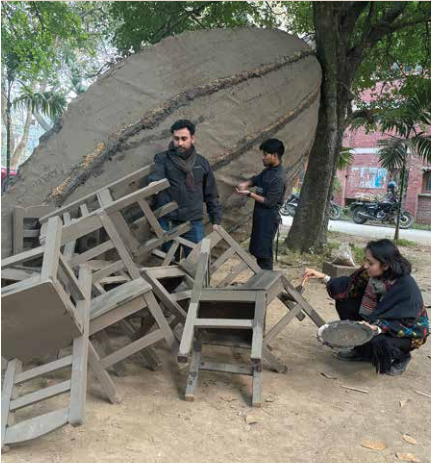
Bamboo, Jute net, Clay, paddy and wood

Nature is omnipotent. Nature is the main source of all energy in the world. Man is one of the parts of nature. In order to sustain the people of the world, nature must be kept alive. It is humans who become a threat to nature and influence it. Climate change is continually affecting both human and animal life. Its influence may be seen everywhere, from agricultural production to the creation of art. Floods and droughts occur every year in Bangladesh. Therefore, these natural calamities disrupt our food production. In recent years, Bangladesh imports food and agricultural products worth about 80 thousand crore taka. In the hope of higher yield and profit, we have imported seeds and destroyed the seeds of indigenous varieties. In terms of taste or nutrition, we feel the lack of indigenous varieties of vegetables or rice.