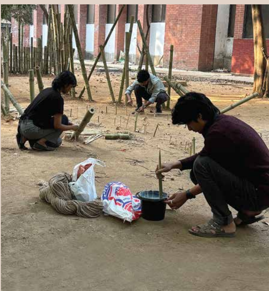
Media : Bamboo, jute rope, Colour

The connection between nature and rivers awakens a self-realization of the natural rhythm of life and the continuous flow of the life cycle. The river's journey from vibrancy to its death symbolizes the flow of human life. In a riverine country like Bangladesh, cities, villages, and settlements have developed around rivers. These rivers serve as the source of their sustenance.